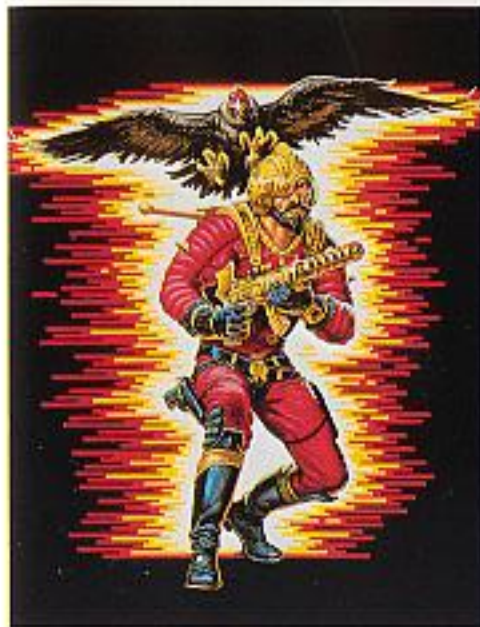
Level 4-3: Voltar™