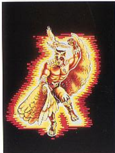
Level 1-2: Raptor™