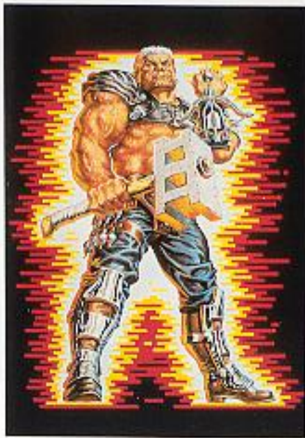
Level 4-2: Road Pig™