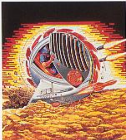
Level 2-2: Buzzboar™