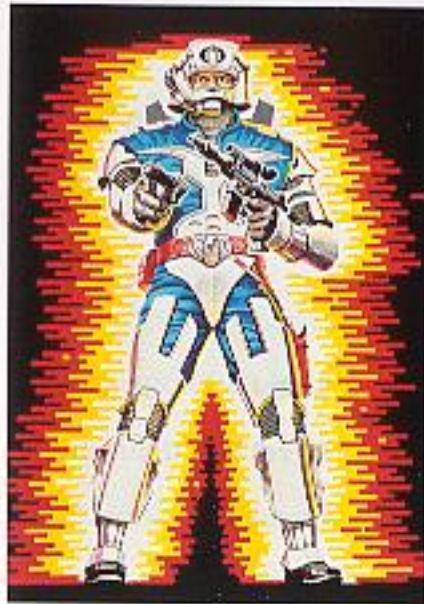
Level 6-1: Cobra Commander™