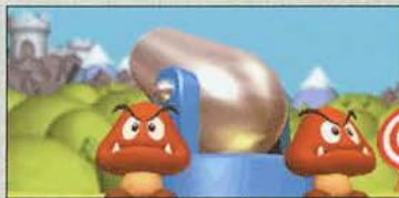
Goombas aiming the cannon at Bowser's castle.

According to eyewitnesses, the mishap occurred when a pair of shady Goombas altered the cannon's direction. Within moments, they had locked up the castle, with Princess Peach trapped inside!