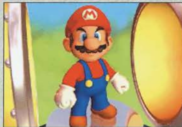
Mario, ready for action!

Without a moment's hesitation, Mario leapt into the cannon to rescue Princess Peach. If Mario collects four Star Keys, he'll be able to get into Bowser's castle. To do that, he'll need to confront many challenges and defeat the bosses who hold those keys! Will he be able to rescue Princess Peach?