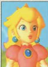
Princess Peach before the ceremony.

During the unveiling ceremony for the new "Sky Cannon" at the Fun Fair, Princess Peach was accidentally blasted off to Bowser's castle! The Sky Cannon, an amazing new transportation device that launches people to new destinations, got off to a rocky start because of this shocking turn of events.