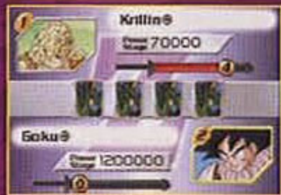
Center of the Table.

Press Up on the Control Pad to view the Opponent's side. Here you can view any Allies, Drills, Dragon Balls®, and Non-Combat cards he has in play. You can also view the number of cards he has remaining in his hand, but not which cards they are.