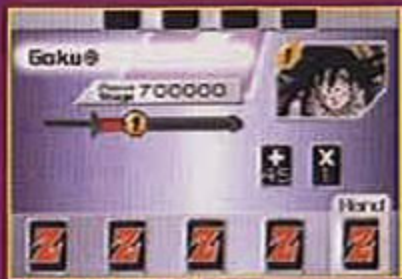
Player's Side of the Table.