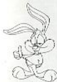
PLAYER: BUSTER BUNNY

HINT: When you reach a doorway, stand in front of it and press the CONTROL PAD up to open it.