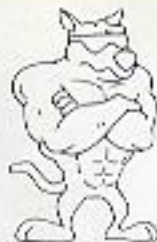
ARNOLD THE PIT BULL