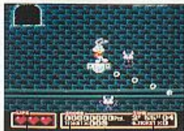
LIFE LINE SCORE TIME LIMIT NUMBER OF TICKETS

When your life line reaches zero, you fall into an amusement park abyss, or you simply run out of time and the ride you're on will end. You can choose to continue the stage, or you can end the game and go back to the title screen.