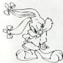
PLAYER: BABS BUNNY