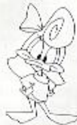
SHIRLEY THE LOON