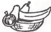
FRUITS OF LONGEVITY