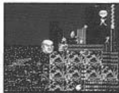
Round I: New York City

The object of Zombie Nation is to break Darc Seed's evil zombie spell by destroying everything in a given area, rescuing as many zombie hostages as possible, and avoiding all enemy fire. You begin the game in the Normal Attack Mode. In this mode, you can fire single projectiles from Namakubi's head by pressing the B Button. The game's action moves progressively to the right of the screen and you control Namakubi's movement on the screen by pressing the Control Pad up, down, right, or left. Zombie Nation takes place in the following four areas of the United States: