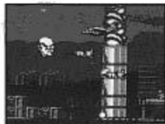
Round III: The Oil Fields of Texas