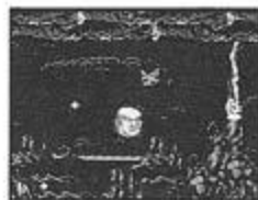
Round II: The Grand Canyon