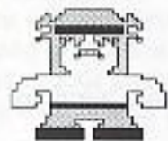
GERONIMO Tomahawk Technique