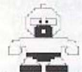
MUSCLE MAN Muscle Driver