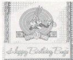
Carrot Symbol A Contraption

If you are caught by one of the contraptions, you will be stunned for a short time. While stunned, you cannot use the hammer. If you are caught twelve times, you will lose a life. The status of your current life is indicated by three hearts in the upper left corner of the screen. Each heart starts out red, turns white, then black and then clear when you are caught by one of the characters or contraptions.