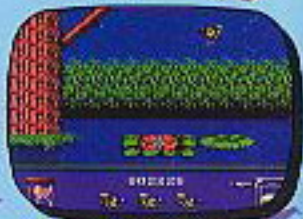
BEE 52 AND JUNIOR

When you blow him away he leaves behind a pick-up bubble. Fly into the bubble to get the pick-up.